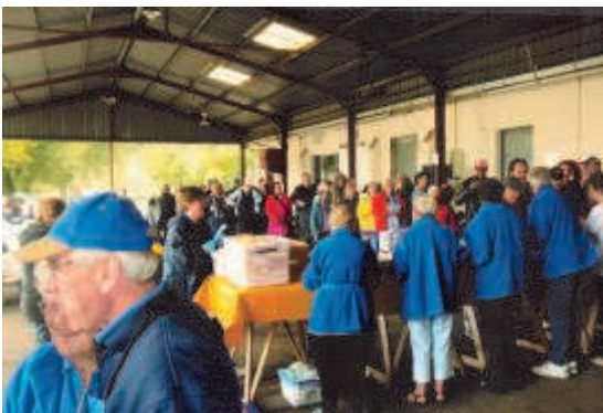
Photo on Left: Foreground Zone 9 Lions ready to serve lunch to the Attendee's of the Zone Picnic

Official publication of Lions District 201 N2 Editor: Jim Armstrong