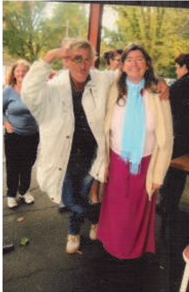
Photo on Right: Attendee's at the 2015 Zone 9 Picnic for the Disadvantaged held at the Moss Vale Showground On Sunday the 22nd