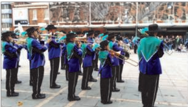
Hunter School students of performing Arts, entertaining the Lions at the MD Convention. Marching, and Flags, and toe tapping music.