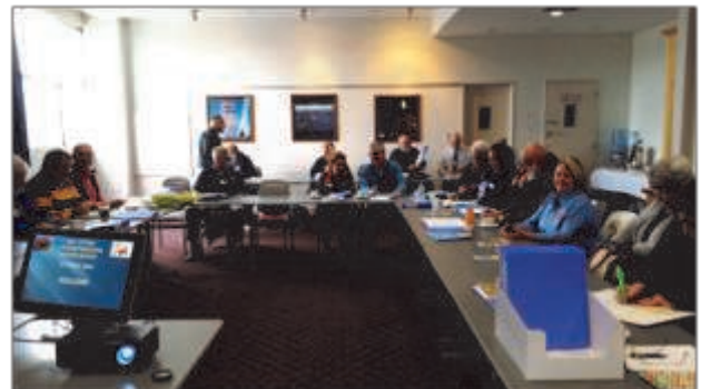
Zone Training at Goulburn, well attended by the Incoming Zone Chairpersons.